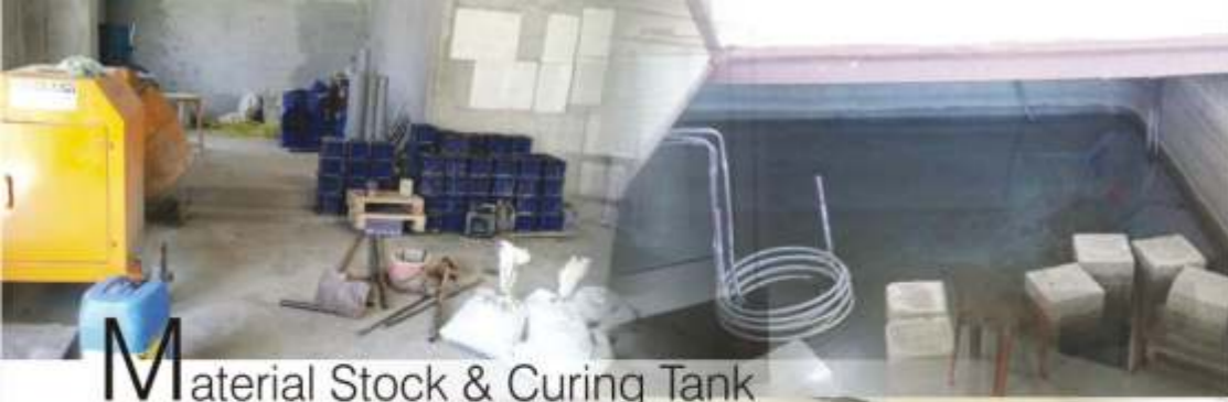
M aterial Stock & Curing Tank