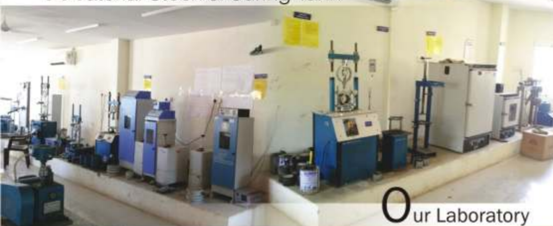
O ur Laboratory