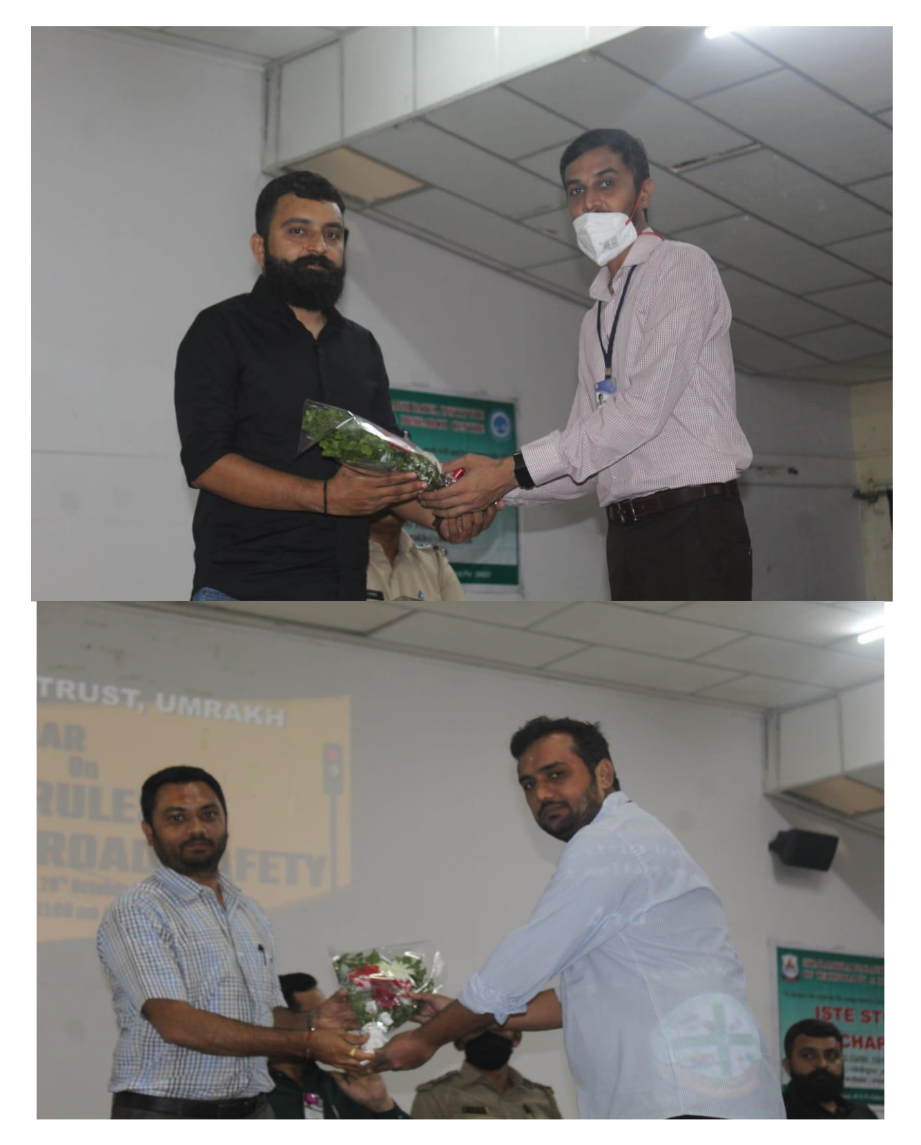
Floral welcome to the delegates by the principal