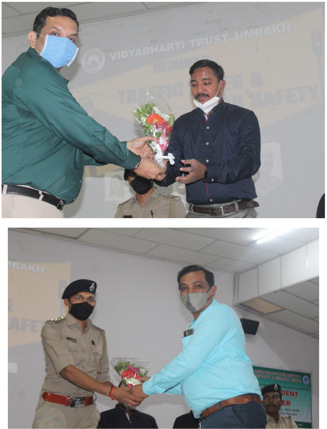
Floral welcome to the delegates by the principal