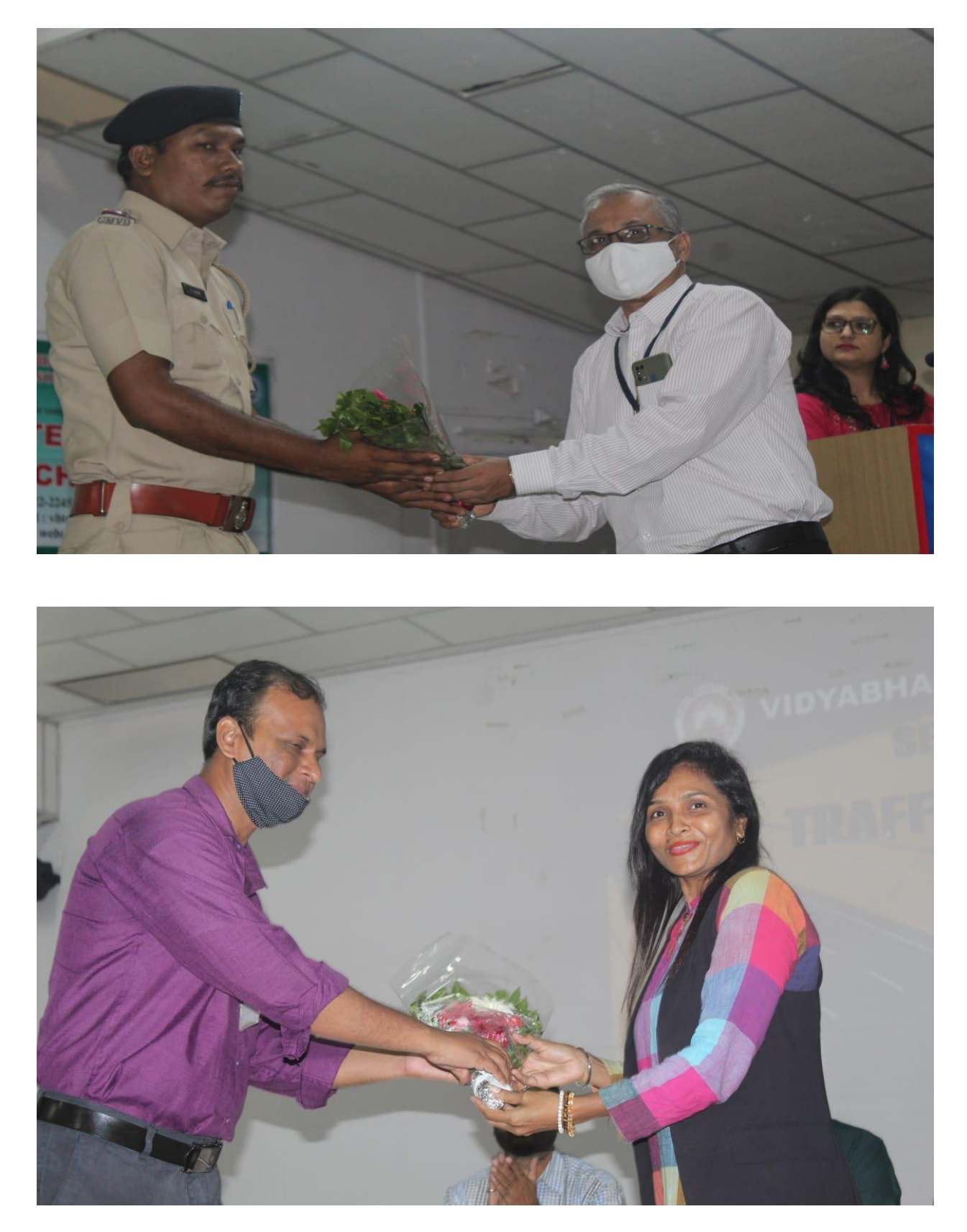
Floral welcome to the delegates