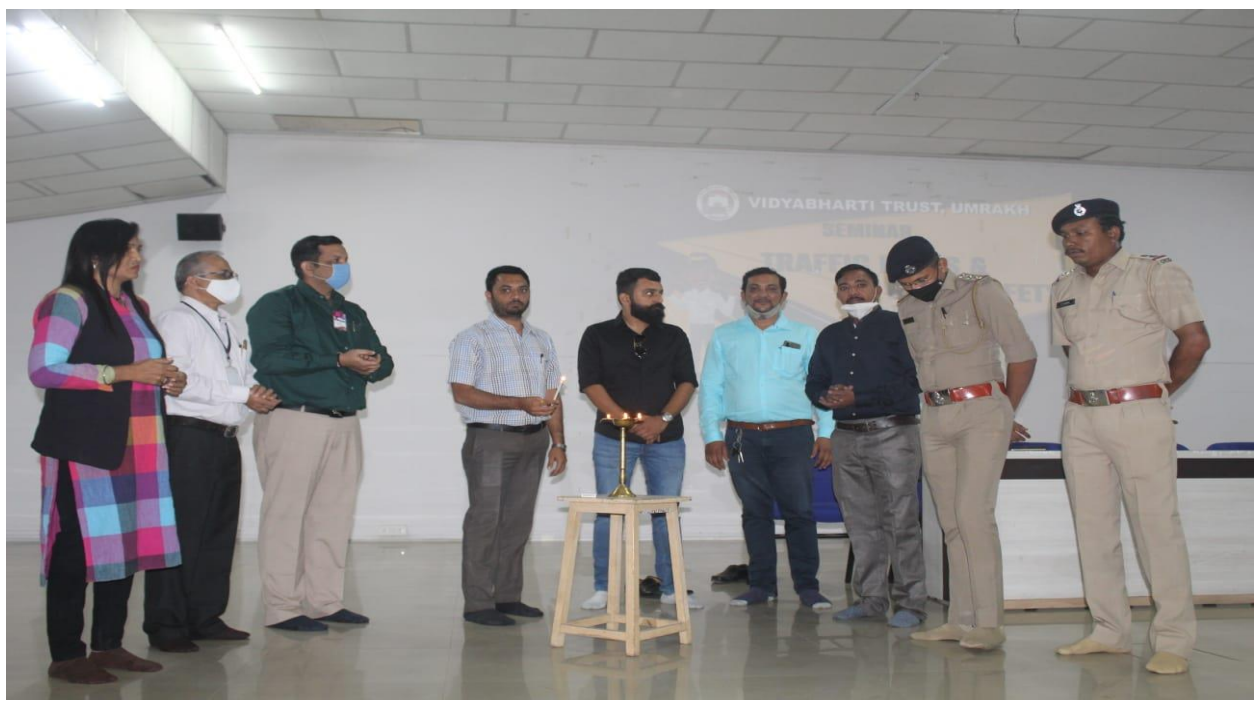
Lamp lighting ceremony