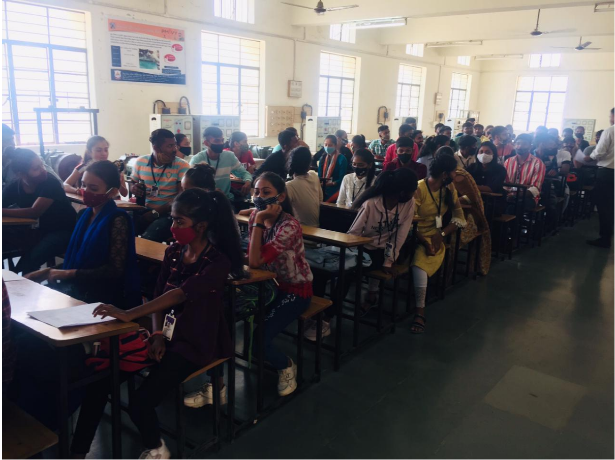
Photograph of ongoing Session In presence of all electrical department students on 10/03/2022