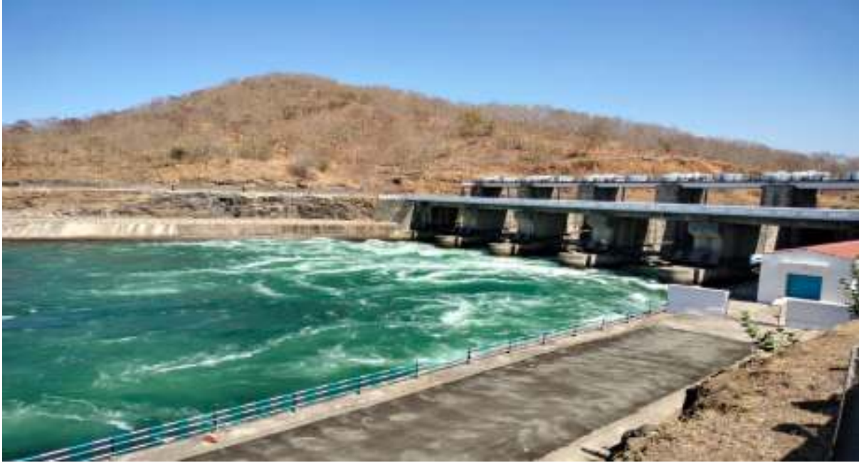
Fig. NARMADA MAIN CANAL