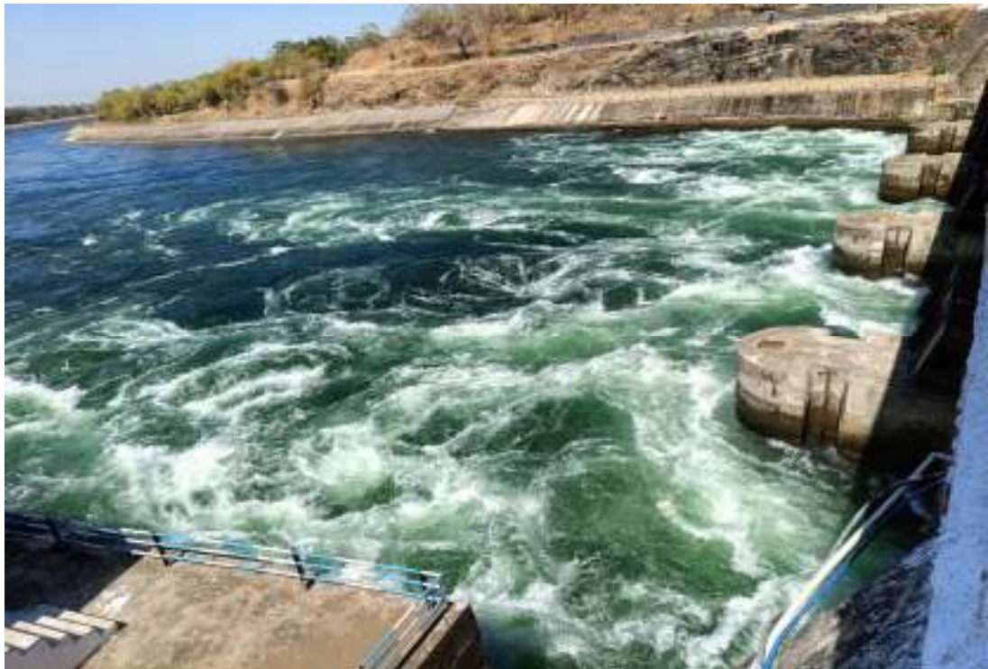
Fig. NARMADA MAIN CANAL